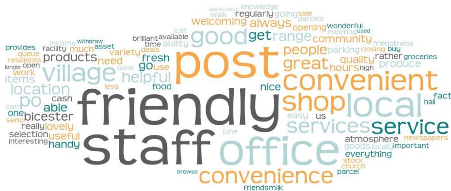
Figure 1 - Shop Opinion Survey Comments

Weston SOS Limited is seeking to raise money through this community share offer to purchase the Weston Pantry Shop and Post Office from its current owner and bring it into community ownership. We believe this will secure its long-term future as an invaluable asset to residents and businesses of Weston-on-the-Green and the surrounding area.