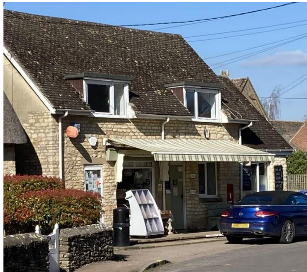
Figure 2 - Weston Pantry Photo